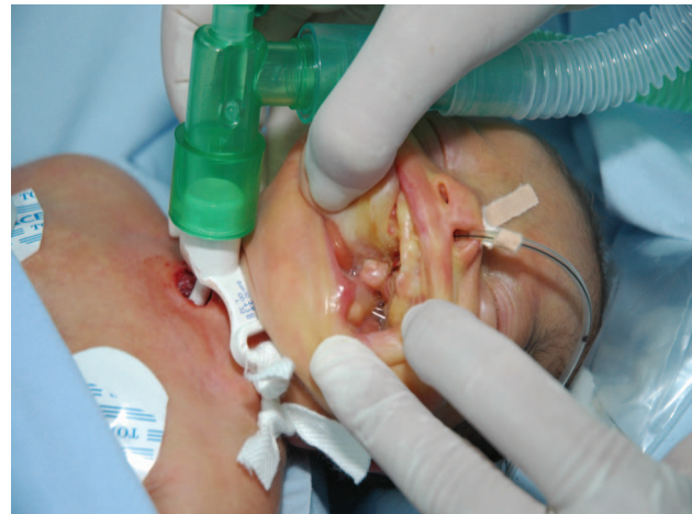
Fig. 2 – Newborn with the hairy polyp after a tracheostomy.

fourth day of life, tracheostomy was performed, and until the definitive operative treatment, the mechanical ventilation support was continued (Figure 2).