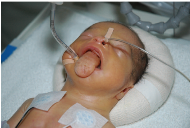
Fig. 1 – Intubated newborn with the hairy polyp.

The female child was born as a second twin from regularly controlled pregnancy. Prenatally, in the 24th week of gestation, epulis gigantocellularis was suspected, the magnetic resonance imaging (MRI) was done and a protruding mass was detected, arising probably from the gingiva of alveolar part of the maxilla. During pregnancy, the polyhydramnios was detected. The child was born in the 33rd gestational week by a caesarean section due to premature contractions of the mother. Its birth weight was 1,720 g, the Apgar score 3/6. Immediately after the birth, a tissue formation connected with the hard palate was observed, protruding out of the mouth, sized 9 × 3 cm, as well as the split of soft palate and tongue. In the floor of the oral cavity cartilaginous-skeletal-fibrous tumefaction was detected. Other anomalies were not noticed.