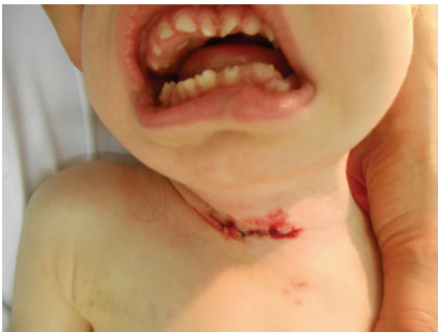
Fig. 5 – The child, 2 years after corrective operation and closing of tracheostomy.

At the beginning of the second year, the split of tongue and soft palate was sewn. With the establishment of normal swallowing, decannulation and closing of tracheostomy were performed (Figure 5), and then gastrostomy was closed.